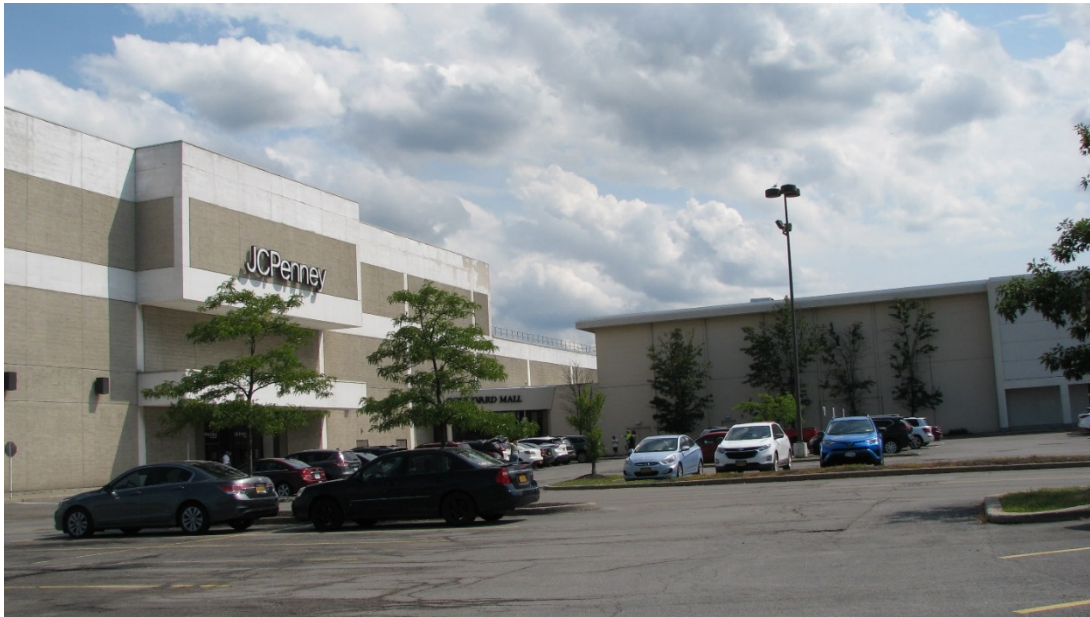
Figure 8-5. Boulevard Mall

Note: Boulevard Mall in Amherst is one of the historic properties that will require evaluation for SRHP eligibility as part of the Proposed Action.