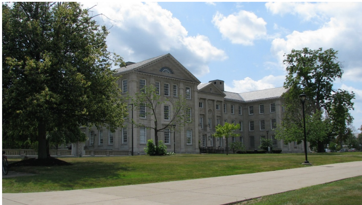
Figure 8-3. University at Buffalo South Campus

Note: University at South Campus is eligible for listing in the National Register of Historic Places.