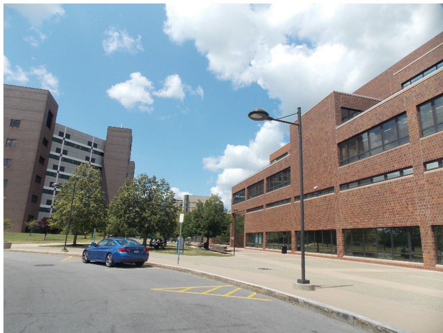
Figure 8-4. University at Buffalo North Campus

Note: The University at Buffalo North Campus is being evaluated for SRHP eligibility as part of the Proposed Action.