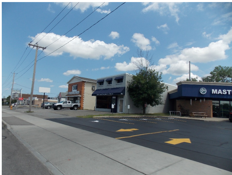
Figure 8-2. Typical Commercial Buildings along Niagara Falls Boulevard

As the Proposed Action alignment moves to grade on Niagara Falls Boulevard, the line is flanked by neighborhoods exhibiting post-World War II and mid-twentieth century forms, although visual survey confirms substantial alterations occurred to many of these residences since their construction. These alterations appear more frequently to properties facing Niagara Falls Boulevard than those located to the east and west that face interior neighborhood streets. Altered commercial buildings are also located along Niagara Falls Boulevard between Paige Avenue and Decatur Road. North of Longmeadow Road, modest mid-twentieth century and contemporary suburban commercial and religious buildings flank Niagara Falls Boulevard. Common suburban commercial architecture continues along Maple Road as the proposed extension turns toward the east. At Sweet Home Road, where the Proposed Action alignment moves toward the northeast, contemporary apartment complexes face the alignment before it turns east toward the UB North Campus, which contains numerous mid-rise institutional buildings dating from the 1970s to the present. The Proposed Action alignment then moves north and east along John James Audubon Parkway where municipal and office complexes, primarily developed after the 1970s, line the parkway until its intersection with Interstate 990.